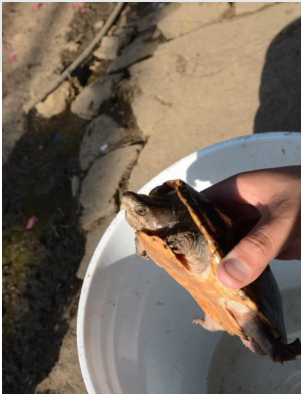
This river turtle was extracted from its habitat and was going to be cooked. However, thanks to the work of the young Bulfrano, it was possible to rescue it and relocate it in a suitable riparian zone