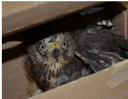
Within the area of combat against wildlife trafficking of Biofutura A.C., the Attorney General's Office of the Republic was able to secure this raptor. The bird had severe damage to wings and tail. Currently, the bird is completely rehabilitated.

As part of actions to rescue wildlife, experts from the organization Biofutura A.C. have implemented for more than a decade comprehensive actions for the safeguarding of biological diversity which include ethical