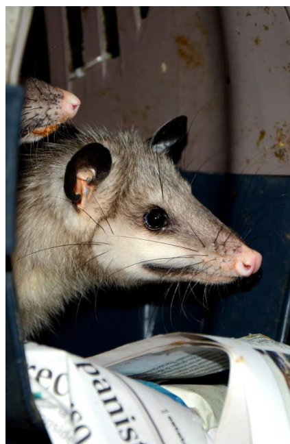
Young opossums (Didelphis marsupialis) who were victims of animal mistreatment are reintegrated into their habitat