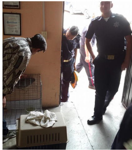
The rescue of the heron was a collaborative work with personnel of the H. Fire Department of the state of Hidalgo. Fortunately, the awareness in favor of the animals has influenced its personnel to establish joint actions with members of Biofutura A.C.