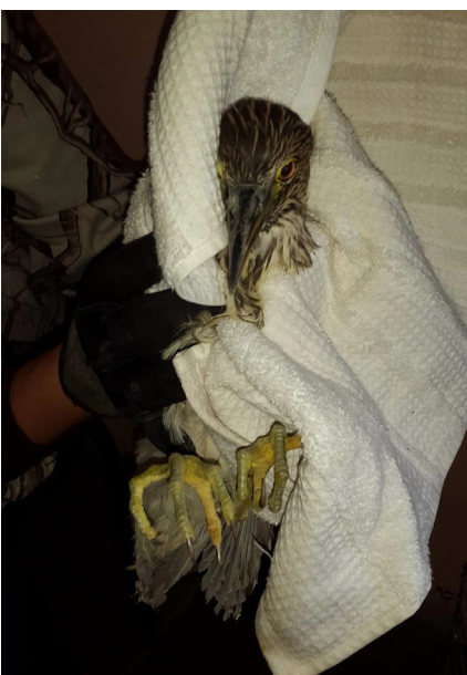
You can see a young heron, which was found in a house in a suburban area. The villagers thought she was an owl because of her characteristic sound, however, fortunately, a group of people contacted members of Biofutura to perform the rescue. Released specimen