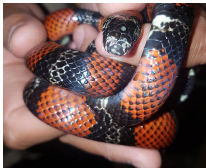
This false coral (Lampropeltis mexicana), an endangered species endemic to Mexico, was rescued from a home in suburban areas. Released specimen

community development, anti-speciesist environmental education seminars and coordinated wildlife rescues in central Mexico mainly when wild animals come into conflict with human interests.