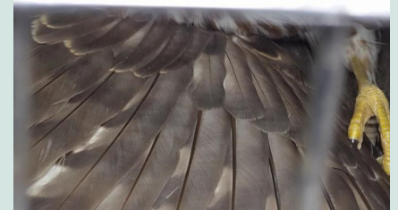
Raptor found lying on the Pachuca-Mexico highway, once secured it was presented to Profepa and released in a suitable place